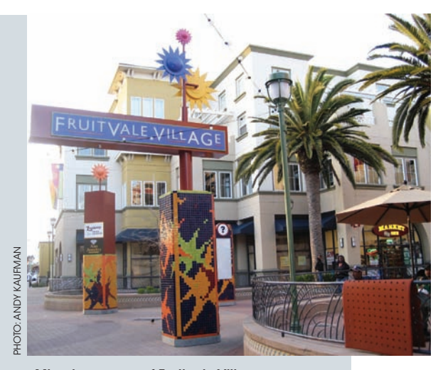
Mixed-use area of Fruitvale Village.

"Transportation planning should be about more than concrete and steel. It should be about building communities and we are all looking to Fruitvale as an example of how that can happen." (Rodney Slater, U.S. Secretary of Transportation.)