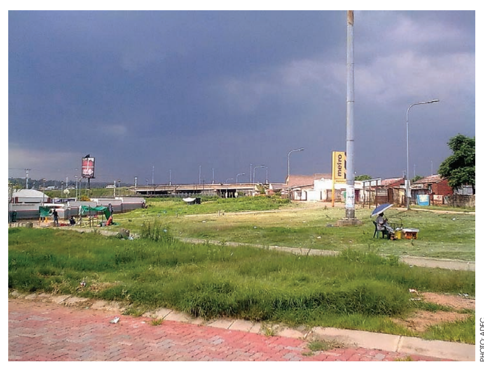
This area immediately surrounding a Metrorail station in Soweto can be significantly boosted by a well-planned transport interchange.

would be unwise to demand of developers too high a percentage of inclusionary housing after providing an incentive for them to invest. The best strategies rely on a combination of "carrots and sticks" to attract private investment while ensuring that such development meets the community's standards and needs for housing and economic development.