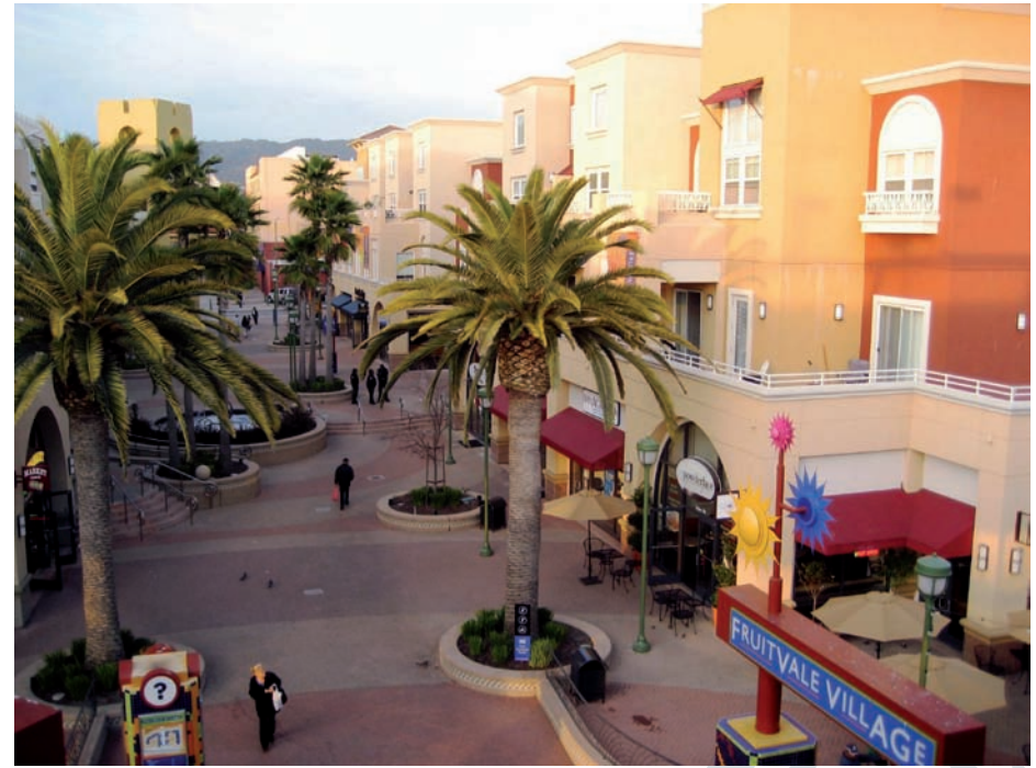
An example of transit-oriented development where value was created