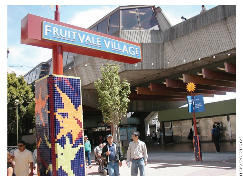
The BART terminus area at Fruitvale Transit Village.

The remainder of this booklet focuses on a way of calculating, with a fair degree of accuracy, the quantum of value that can be added by investment in transport interchanges, allowing authorities to negotiate with role-players ahead of time around capturing some of that value for public good.