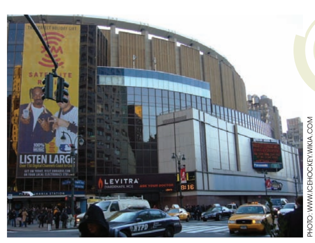
Madison Square Garden built over the Pennsylvania Railway Station.

Land banks are used by local governments for a variety of public purposes. Most relevant is where local government acquires land located near or within TOD hubs. An increase in the value of land can then be captured by the public sector through income from leasing and sale. Leasing, as opposed to outright sale of land, gives the public authorities more autonomy and flexibility in directing development to public purpose over the long term. A disadvantage is the possibility that revenue can be redirected to general fund purposes unless policy is written to control use of funds.