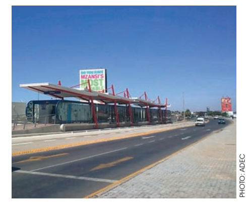
BRT station in Soweto showing the potential for local economic development.

TOD is a straightforward concept: concentrate moderate and high-density housing along with public uses, jobs, retail and services in mixed-use developments located at strategic points along the regional transit system. Each TOD has a centrally located transit stop and core commercial area and accompanying residential and/or employment uses within an average 600 to 800 metre walking distance. The location, design, configuration, and mix of uses in a TOD provides an alternative to current suburban sprawl and vehicle-dominated