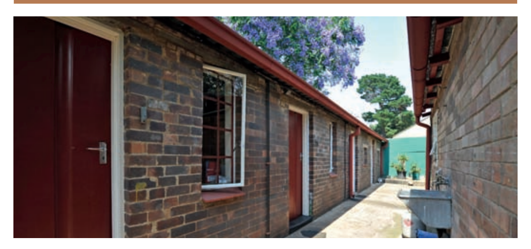
Domestic worker quarters converted into rooms for rent.

There is also an increasing awareness that current housing programmes do not meet the human settlement requirements of all households. The inability of a "one size fits all" subsidy policy to meet the required diversity of affordable accommodation demand is clear. This was acknowledged in the Breaking New Ground (BNG) strategy revision in 2004, yet the stated intent to offer a greater choice of tenure, location or affordability has to date not been realised to any significant degree<sup>18</sup>. Prioritising fullysubsidised, low-density, detached, freehold family accommodation over other delivery modes, tenure systems and accommodation outcomes is therefore not a justifiable response to South Africa's diverse and changing demographic composition.