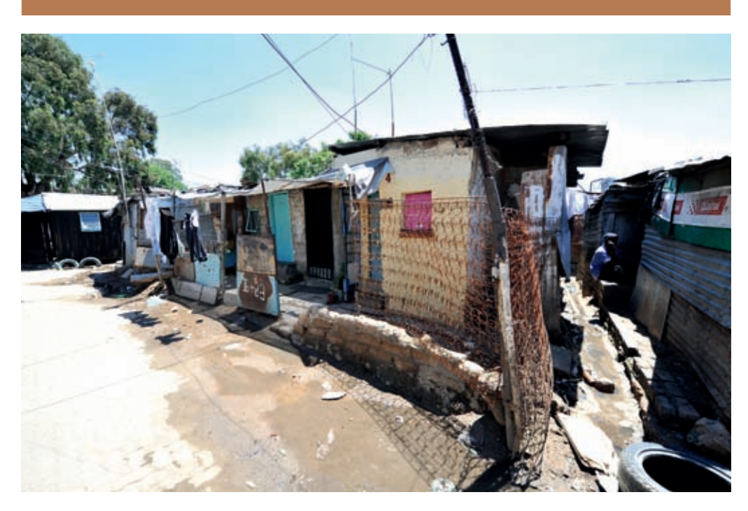
Another example of shack rental.

<sup>23</sup> Informal tenure (that is, not recorded in a formal lease) must not be confused with insecure tenure. Although in certain circumstances the security of tenure of small-scale rental occupants is unclear, evidence such as the length of time renters stay in small-scale rental units and perceptions of security from tenants indicate that a well-regulated tenure system exists.