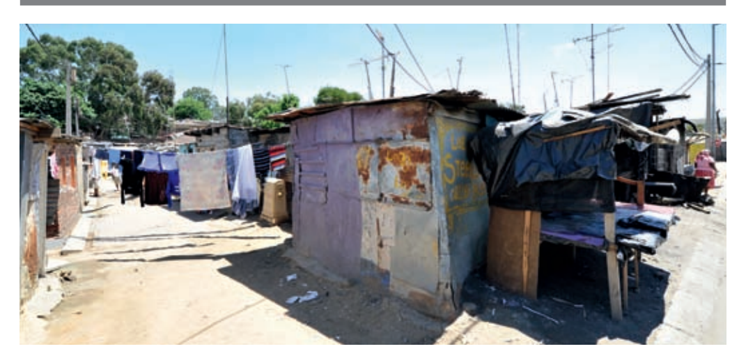
Multiple backyard rental shacks in a township.

The lack of a clear definition of this type of accommodation and delivery system is partially responsible for its misinterpretation. Many terms and definitions are applied to small-scale rental, many of which are factually misleading, refer to subjective definitions or generalise conditions found only in a proportion of accommodation in this sub-sector. These terms include: