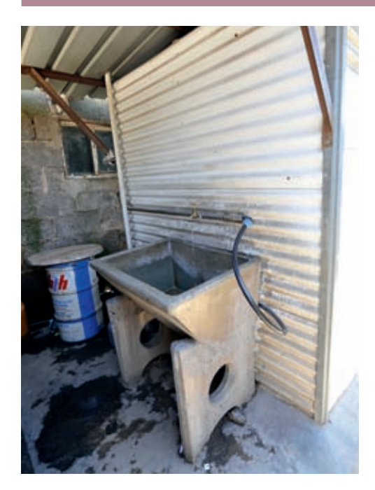
Shared washing facilities in the yard.

A potential ethical dilemma exists with subsidising households that may have already received subsidies for housing through any of the RDP or BNG subsidy programmes. However, there are many households that could benefit from such a programme that have not yet benefited from state housing subsidies, and may not benefit directly in the future. These include households in private housing, in rural homesteads, and those in aging ex-council accommodation produced in the 1960s, 1970s and 1980s that can be considered to have amortised their useful life, many having transferred to new households or occupants.