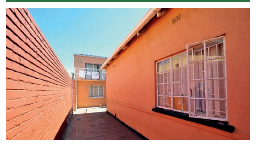
Multiple-room units for rent in a backyard with the main house in the foreground.

A further precondition is access to on-site infrastructure such as sanitation, water and electricity. In certain cases external access to services already exists, but at worst this requires a link to internal services on-site or possibly to mains lines on the boundary of existing sites.