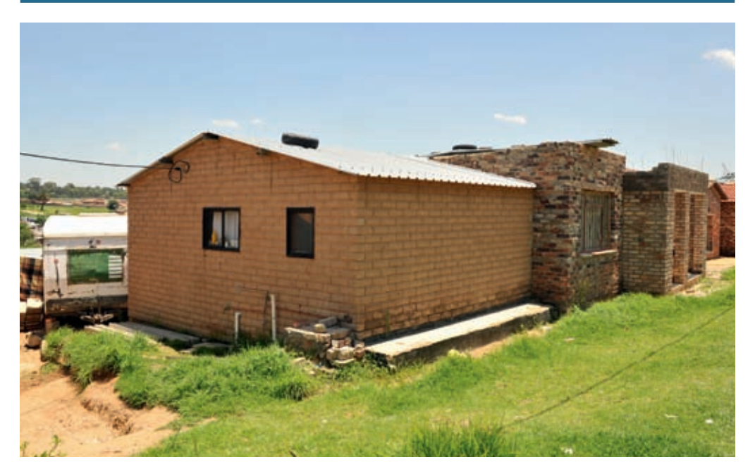
Additions to an RDP house, with caravan accommodation on the left.

rental units (inferred from Smit Table 7:68)<sup>33</sup>. This could have the unintended consequences of creating an unnatural movement of people out of relatively better backyard accommodation in favour of informal housing, in the hope that they will be given subsidised houses.