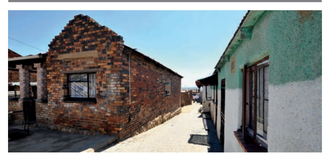
A row of rooms for rent alongside a township house.

Using these different and often misleading terms interchangeably in policy discourse leads to a misrepresentation of this accommodation sub-sector, the shelter conditions and human settlement benefits it offers<sup>5</sup>. Critically, these terms polarise views about an important, complex and little-understood housing sub-market and delivery system. Through doing so, this leads to inappropriately conceived policy responses to such accommodation. A universal definition must separate the accommodation delivery system, the accommodation outcome and the subjective description of the accommodation quality. The delivery system refers to the processes through which this accommodation is procured. The accommodation outcome refers to the objective definition of the accommodation form and type. For example, the outcome refers to whether the accommodation is built with formal/durable or informal/ temporary materials; whether it is conventionally or unconventionally constructed, its size and the level of services it has. The subjective description of quality relates to the perceptions of acceptability and illegality in relation to currently defined norms, standards and regulations relating to human settlement. It is only by separating these three elements that an informed response can be developed to the potential of this delivery system as a viable approach to the procurement of affordable rental stock.