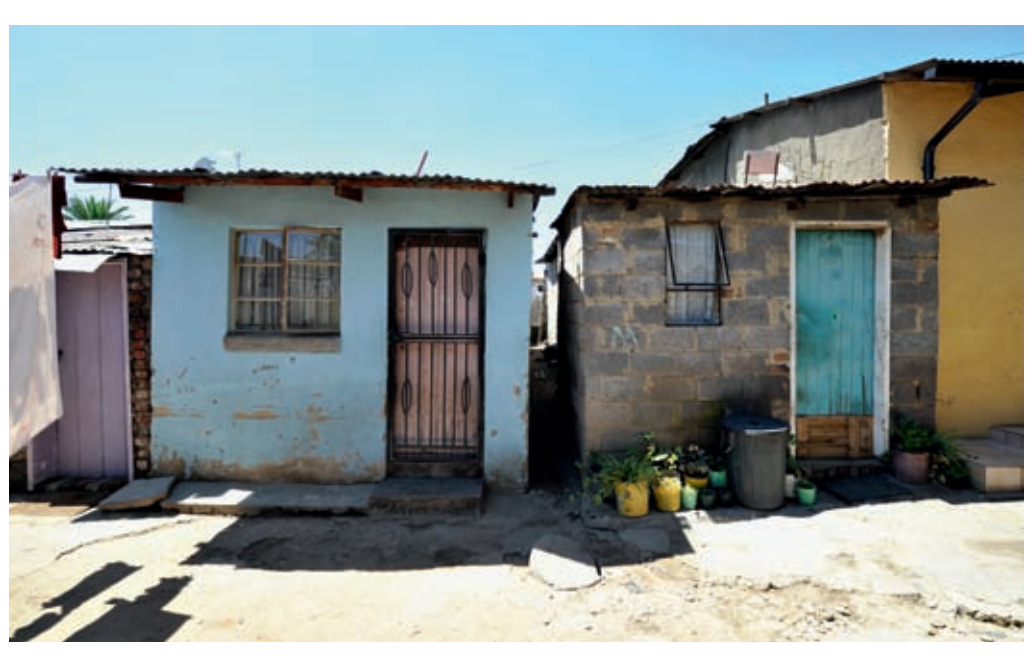
Yard rental opportunities.

The location and design of the primary and small-scale rental units on-site is also critical to ensure that sufficient space exists for the construction of small-scale rental units, while still maintaining boundaries between private, semi-private and public space on-site. For instance, generally, the placement of BNG houses in the middle of sites reduces the amenity for owners who would like to add small-scale rental units on their property due to the need to "crowd" such units behind the main house. Better initial layout planning can create more appropriate layouts that better manage the use of yard space by the primary and secondary households.