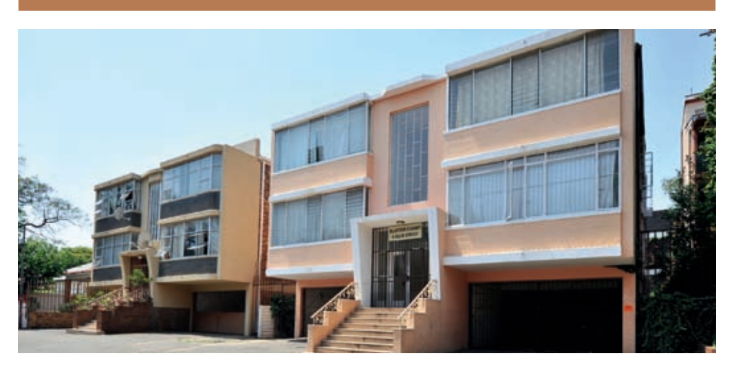
Medium-density rental units.