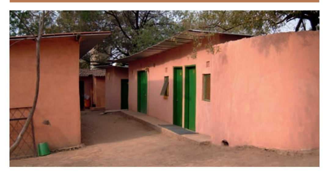
Suburban rooms for rent.