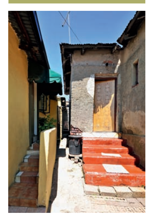
Rental accommodation alongside a formal township house.

It is not clear, but is assumed that as a result of referring regularly to "backyard shacks" and "slums" in policy discourse, and the inclusion of census figures for "backyard rooms" and "backyard shacks" into national backlog statistics, that small-scale rental is officially considered to be "slum-like" and therefore an overt target of "eradication" under the government's incorporation of its MDG commitments. Furthermore, "informal rental" is seen in some quarters to be "undermining" the eradication of informal settlements (Carey, 2009).