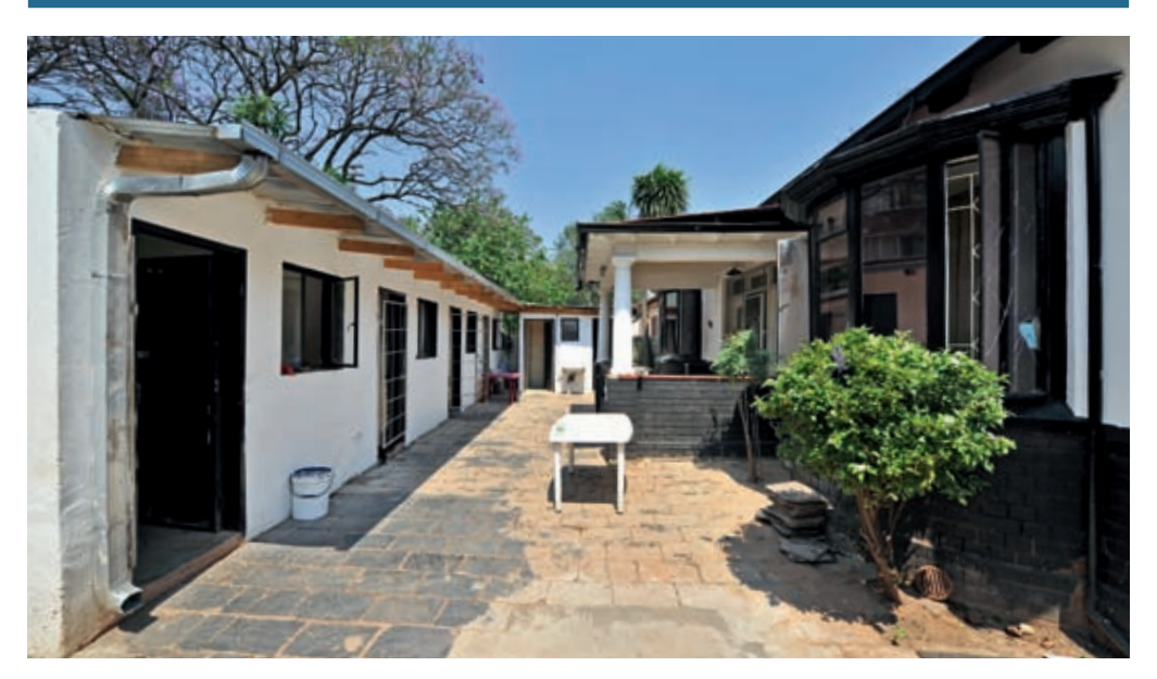
Rows of rooms to rent on the left with shared ablutions at the end.