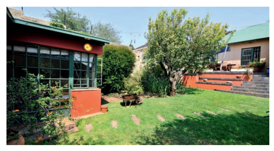
A suburban garden cottage on the left with the main house visible.

appropriate technologies and moving away from the conventional "one size fits all' approach to housing delivery. All of these policy statements clearly point to the need for a settlements policy that considers the role of small-scale rental in overall human settlement development processes.