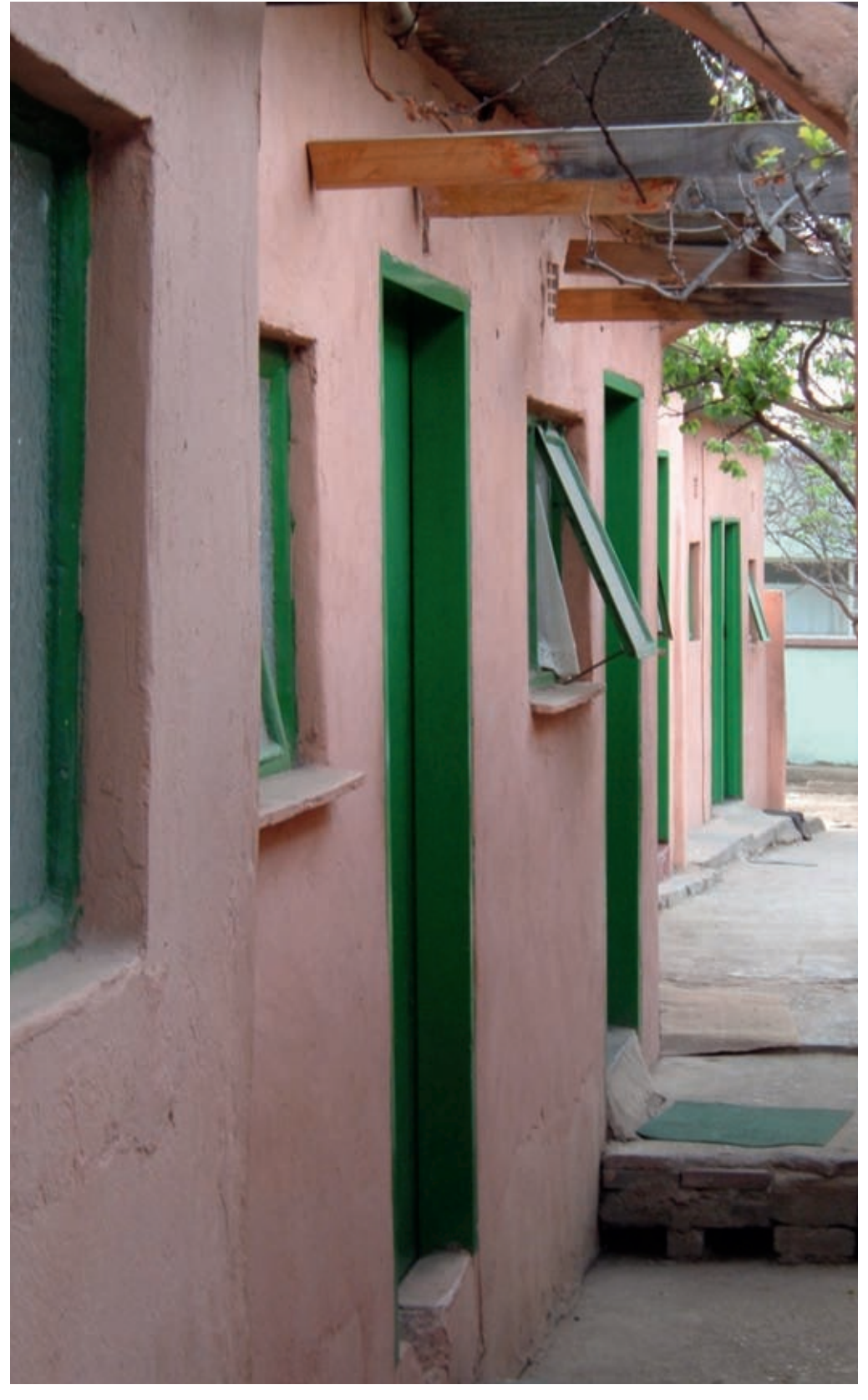
Private rental accomodation.