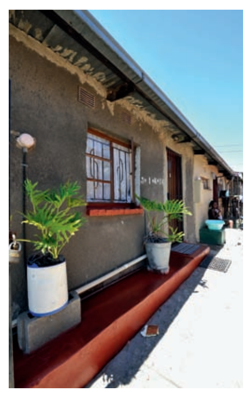
Another example of rental units down the length of the site.

A small-scale rental strategy should not deal with de-densifying directly, nor should it deal with improving or gentrifying standards in existing areas, as this will shift the focus from stimulating new, appropriate accommodation production through this delivery system to rather interfering in the fragile existing small-scale rental sub-sector. The likely outcome of such a strategy would be to upset the intricate supply and demand patterns, leading to, at best, displacement of the poorest and most vulnerable households