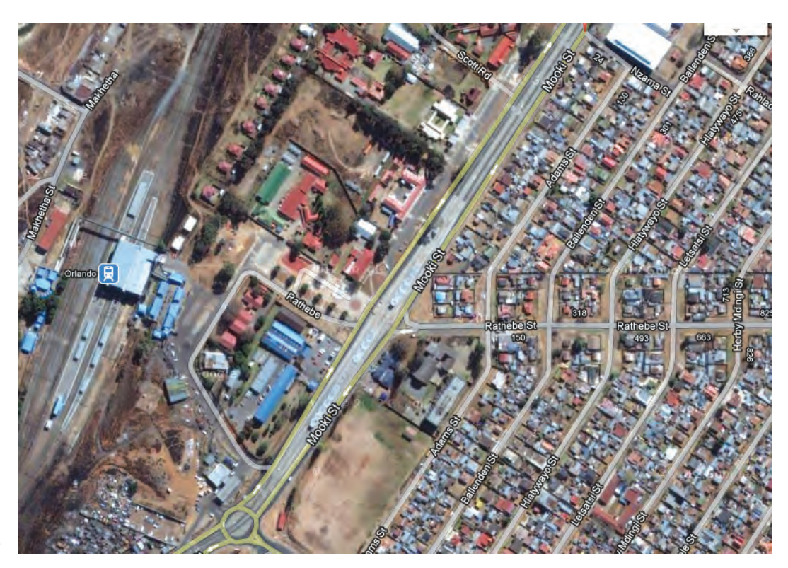
Mooki Street Bus Rapid Transit stop, Soweto