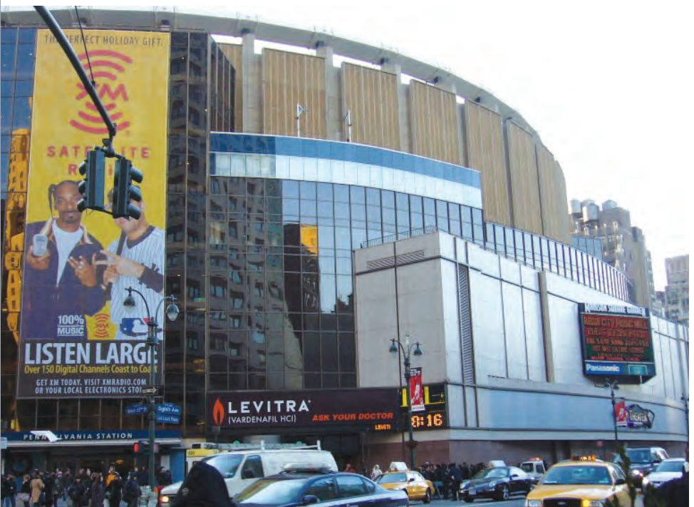
Madison Square Garden built over the Pennsylvania railway station, US

This creates potential opportunities for local authorities, but also some difficulties. By providing infrastructure in established 'wealthy' nodes, revenue generation to the local authority can be maximised. If used correctly, this can cross subsidise pro-poor developments such as inclusionary housing in the area. However, if the infrastructure provision occurs in established nodes in the absence of a pro-poor policy and without clear decisions on how the additional funds are to be used, there is a danger that the value capture exercise will merely result in the perpetuation of the existing inequalities and skewed investment patterns in the city.