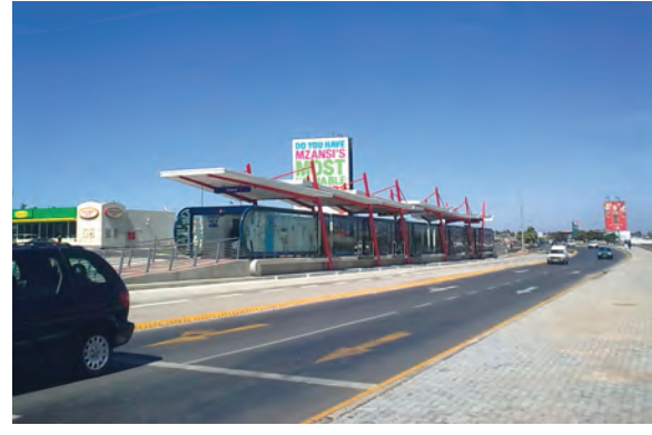
A Bus Rapid Transit station in Soweto, Gautena

Municipalities can use transit-oriented development to establish mixed use, mixed income communities in a city and improve residents' quality of life. The mix of jobs and housing in an area helps to reduce transport and opportunity costs for poor people, thereby raising living standards.