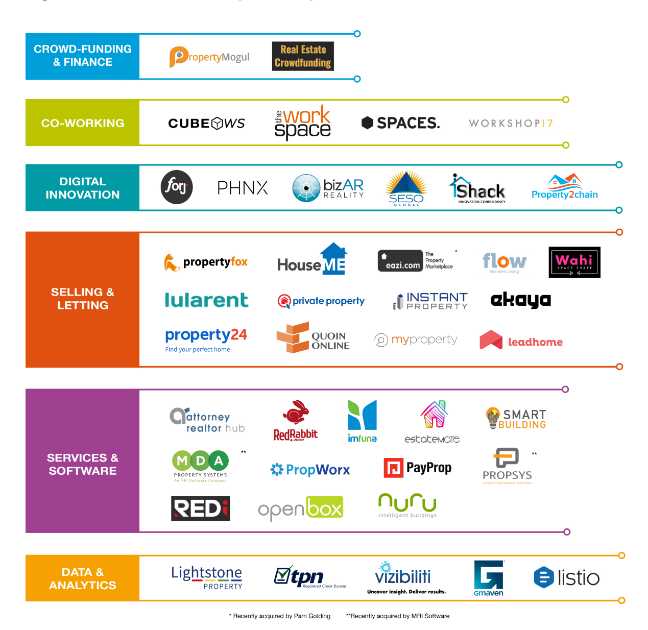
Figure 3: South African Proptech Map

We identified 42 active players in the proptech sector in this initial research and categorised them accordingly. These categories were largely guided by the three key tech trends discussed previously and the type of activity we found in the South African proptech sector.