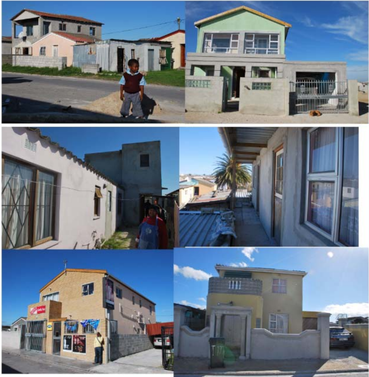
Figure7 Highest level of extension among plots included in 2011 sample.

A quick glance at the extension process of the households included in the 2011 sample (see Figure 3) shows that residents are still in the midst of their consolidation process. Most extreme is the situation of a woman who aspires to build what is locally referred to as a ‘family house’: a permanent and solid structure “to which the children can always come back”. 21 The now grandmother has worked for 22 years on the construction of an ‘upstairs’ to the initial core. During the focus group discussion she described the past 22 years of extending as “a real struggle” 22 .