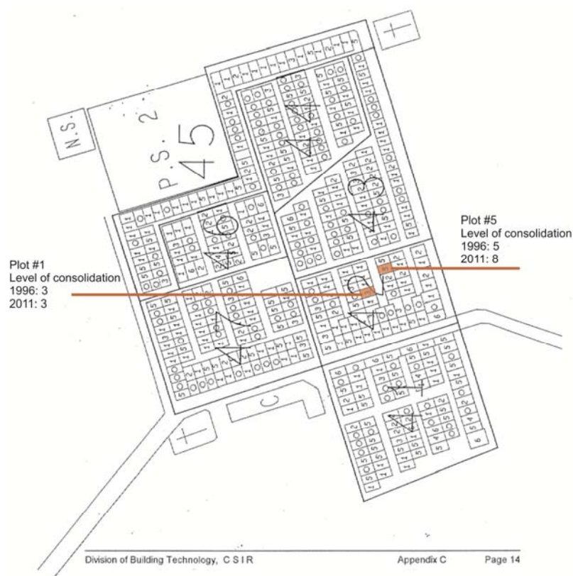
Figure 3: Map illustrating plot identification on the 1996 aerial photography, and the assessment of the type of extension 11 and 26 years into consolidation.