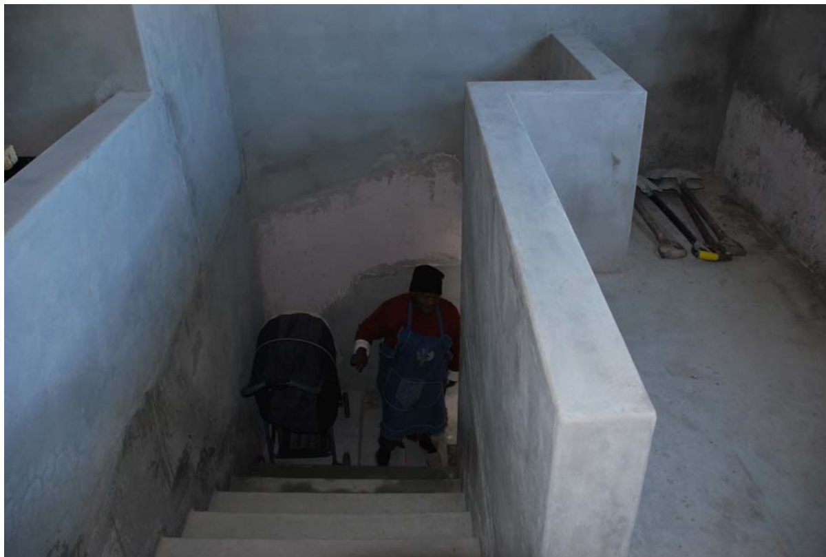
Figure 4 Grandmother, the original owner of the plot and initial core-house, her daughter now coordinates the priorities and preferences of extending so that new generations can live in it.

The only non-extender included in the 2011 fieldwork proves to be an interesting illustration of how a snapshot in time can fail to capture the dynamics of plot usage and the consolidation process. At first glance, the core house appears to be unextended and the plot under-utilised, despite the fact that it has been 26 years since occupation. However, aerial photography conducted 15 years earlier proves that extension had taken place – a small, attached, impermanent extension had been added to the core house. Using these two snapshots along with information from the consolidation process helped to make more specific enquiries as to plot usage over time. The original occupant, who owns the plot, moved back to a rural area, and is now sub-letting the core house to a young couple with a baby. The inhabitant explains that the owner removed the impermanent extension before they arrived. If the couple decides to stay and they can afford to do so, they will extend the house by adding an extra room for the child, thus starting the cycle over again.