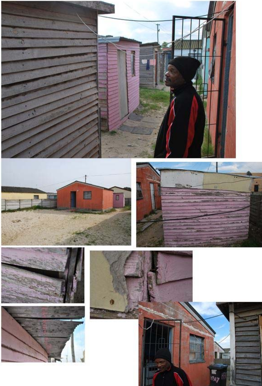
Figure 5 Contiguity, positioning of extension of impermanent material. Not the only one hiding the shack...

It is through the stark contrast with the status of conventional material, that the use of impermanent materials beget powerful negative connotations for the residents in areas such as Khayelitsha. The physical positioning of the extensions, depending on the use of material, reflects that contrast, when households either show off or hide the structures. Even among the most successful extenders in the 2011 sample, careful consideration was given to hiding impermanent material or construction chaos from the street side. A shack would rarely be placed in full street view (see Figure 5).