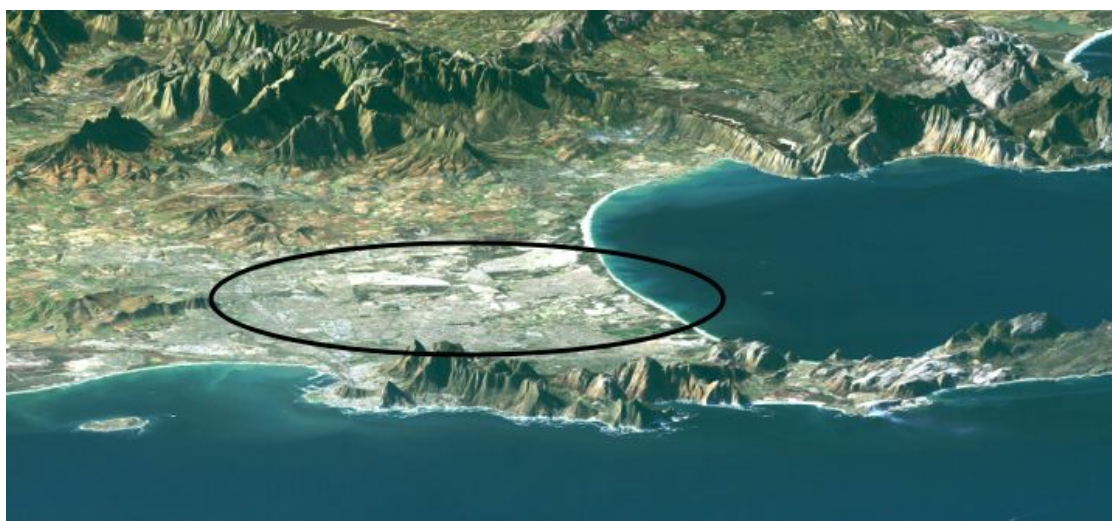
Figure 1 Cape Flats. The oval (long axis about 25km) roughly encompasses the Cape Flats.

Housing is always interwoven with politics, but in this particular housing project perhaps even more so. The Flats (see Figure 1) are described by some as 'Apartheid's dumping ground' since from the 1950s race-based legislation either forced non-white people out of more central urban areas designated for white people and into government-built townships in the Flats, or made living in the central area illegal, forcing many people designated as 'Black' and 'Coloured' into informal settlements elsewhere in the Flats. Khayelitsha was deliberately located beyond the urban edge of Cape Town at the time, at a distance of 35 km from the centre; east of Mitchell's Plan and South of the N2 freeway (Napier 2002). Clearly this is less marketable land for development; the site's geography is typical of the Cape Flats and has problems of wind-blown sand, a high water table, flooding, and lack of vegetation (Napier 2002; Dewar & Uytendogaardt 1991).