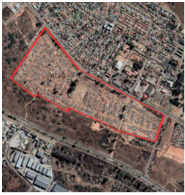
Aerial view of the Rugby Club, after re-settlement of households 2022