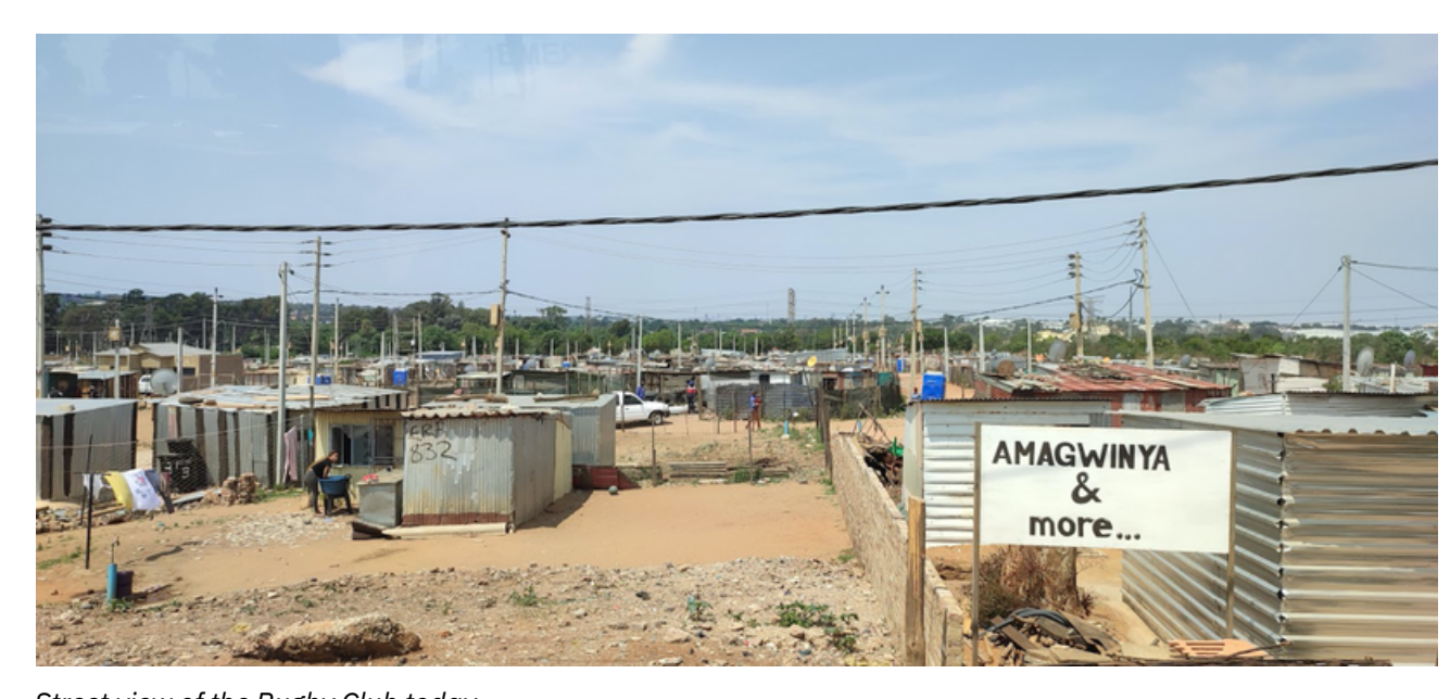
Street view of the Rugby Club today