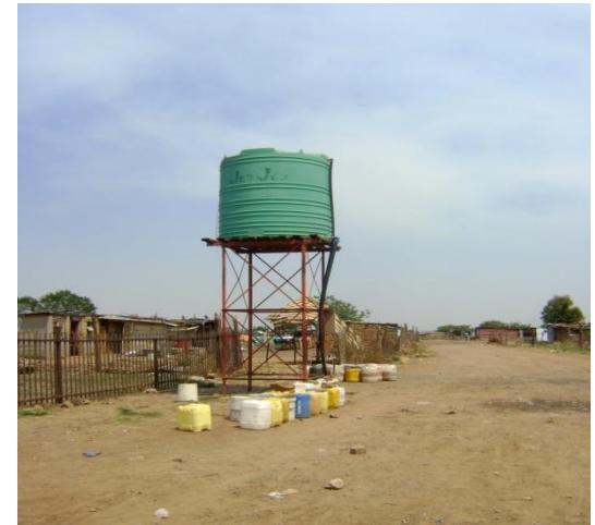
Current water provision in Springvalley